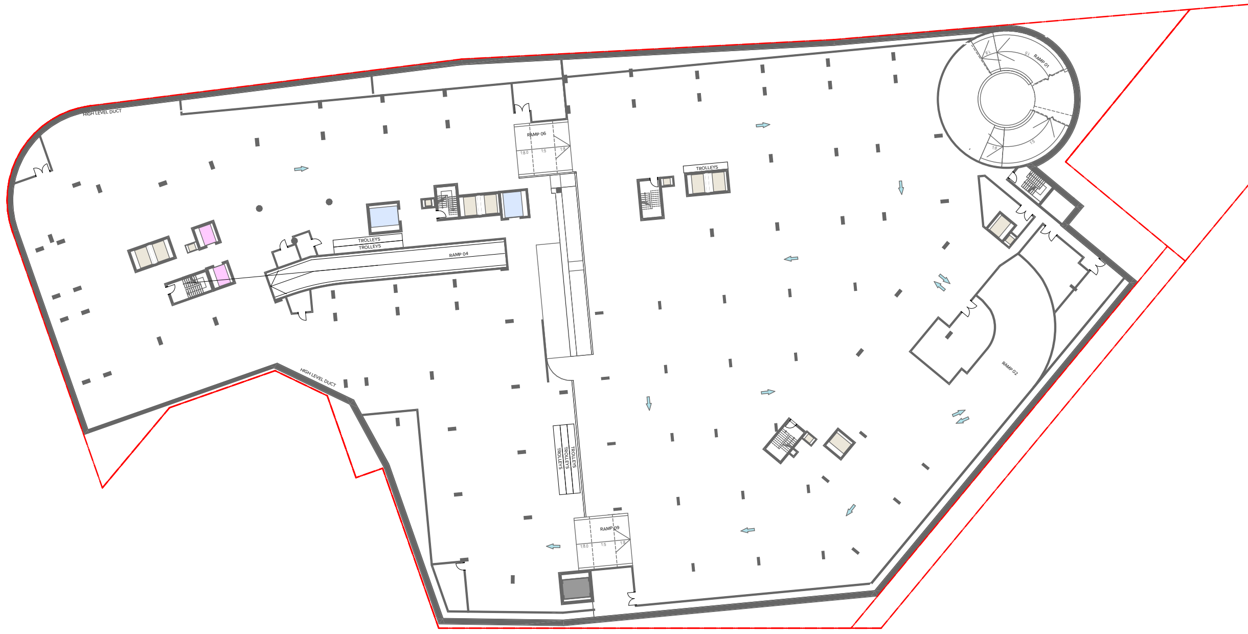
1 Basement 02 1:500