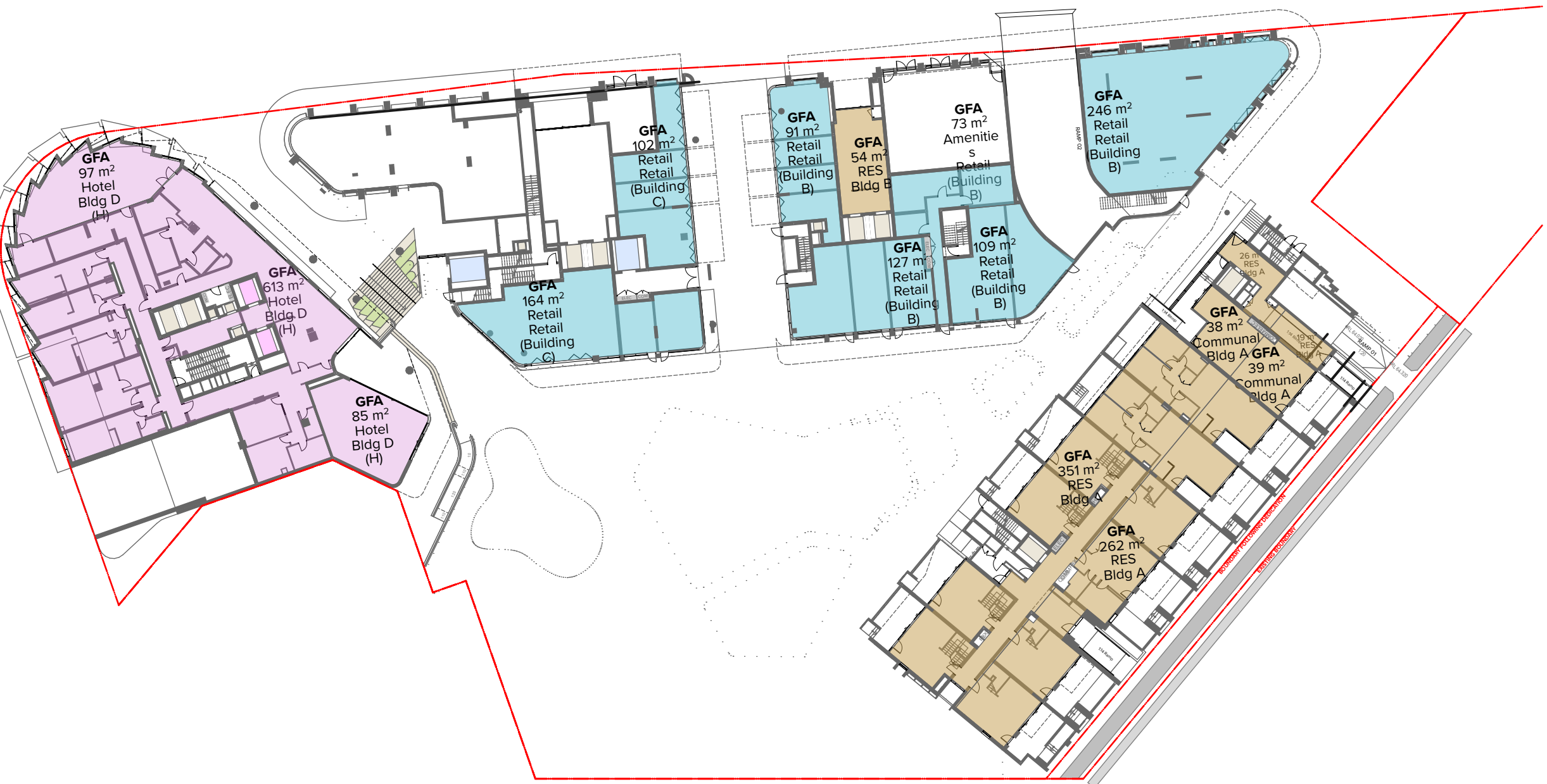
4 Upper Ground 1:500

NOTES THIS DRAWING IS COPYRIGHT © OF TURNER. NO REPRODUCTION WITHOUT PERMISSION. UNLESS NOTED OTHERWISE THIS DRAWING IS NOT FOR CONSTRUCTION. ALL DIMENSIONS AND LEVELS ARE TO BE CHECKED ON SITE PRIOR TO THE COMMENCEMENT OF WORK. INFORM TURNER OF ANY DISCREPANCIES FOR CLARIFICATION BEFORE PROCEEDING WITH WORK. DRAWINGS ARE NOT TO BE SCALED. USE ONLY FIGURED DIMENSIONS. REFER TO CONSULTANT DOCUMENTATION FOR FURTHER INFORMATION (DWG, PC AND BIM) FILES AND UNCONTROLLED DOCUMENTS AND ARE ISSUED FOR INFORMATION ONLY.