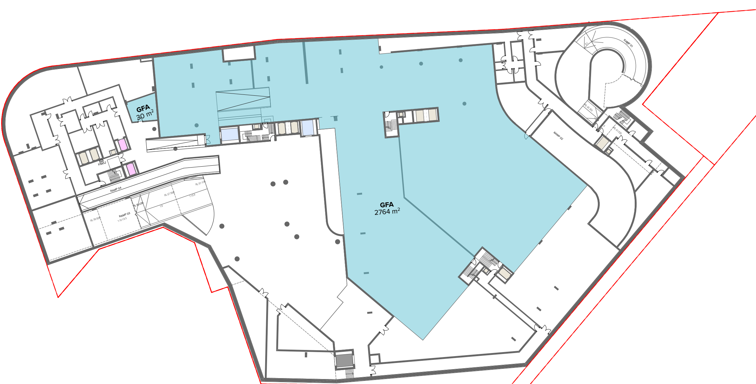
2 Basement 01 1:500